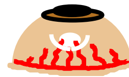
De novo Neovaskularization